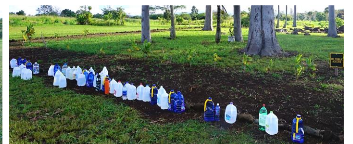
Mālama Kūkaniloko included the task of root-watering the newly planted trees marked by bright orange flags. The 80 plus gallons of water were hand carried in by the Kamalani Academy haumāna...EŌ